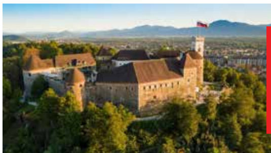
Ljubljanski grad Ljubljana Castle

Prebivalci, pa tudi številni obiskovalci pravijo, da je Ljubljana mesto po meri človeka. Kljub temu, da se uvršča med srednje velika evropska mesta, ohranja prijaznost manjšega kraja, hkrati pa premore vse, kar imajo velike prestolnice. Medtem ko pozimi pride na plan njen zasanjan srednjeevropski značaj, jo poleti odlikuje mediteranska sproščenost.