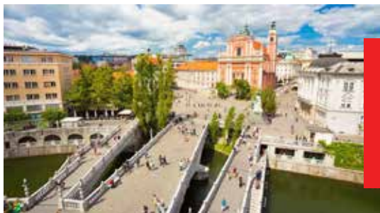
Tromostovje Triple Bridge

Both its residents and numerous visitors perceive Ljubljana as a city built on a human scale. Despite the fact that it ranks among the mid-sized European cities, it has preserved its small-town friendliness and, at the same time, it has everything that all the larger capitals have. In the winter its dreamy central European character prevails, while the summer brings out its relaxed Mediterranean feel.