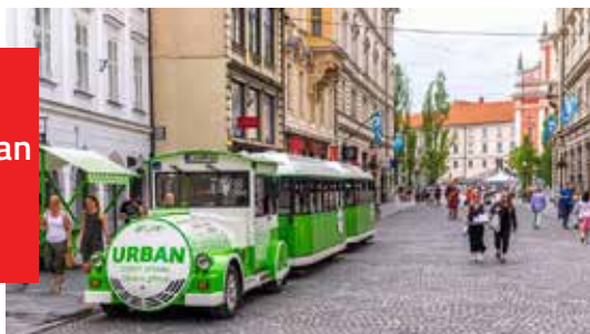
Električni vlakec Urban Urban electric train