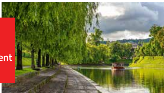
Trnovski pristan Trnovski pristan embankment

Pet glavnih razlogov zakaj obiskati Ljubljano: